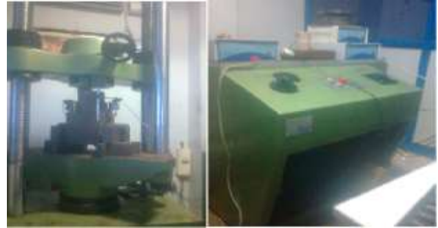
Figure.3 (a) (b)

Compression and Shear tests for the Elastomeric Isolators samples were done using Universal Testing Machine (UTM). It is shown in the figure given below.