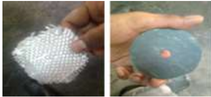
Figure.1. (a) glass fibre, (b) steel plate.

to the circular shape with the diameter of 70mm. Fibre also has to cut at the same shape and size