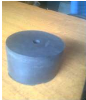
Figure.2. Steel reinforced base isolator

Arrange equal number of steel/fibre and rubber layers in the mold. An isolator has maximum of 22 rubber layers and 20 fibre layers. After that keep it in compression molding machine at 150 C for 15 minutes. Finally take the product out from the mold and send it for testing.